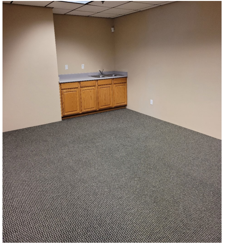
Conference Room/Work area